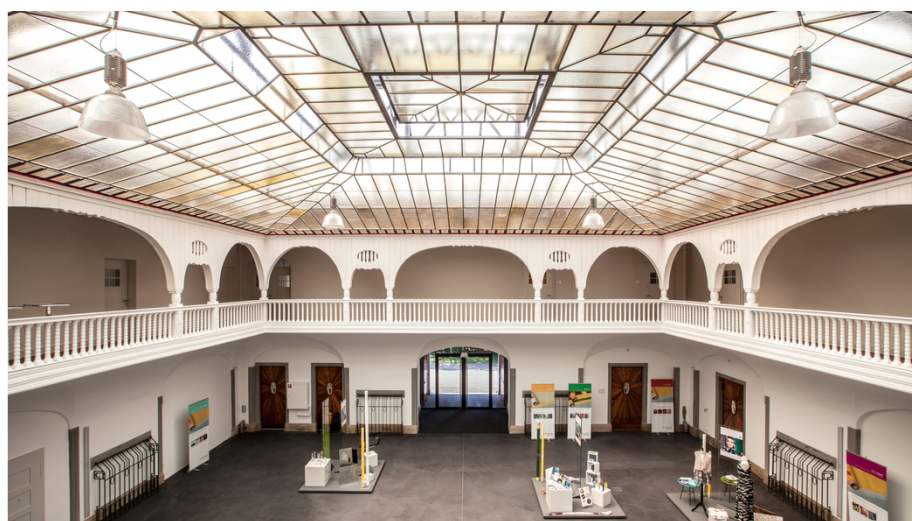
Sefar Competence & Training Center, Screen Printing

The intensive screen printing course covers a wide range of topics, from mesh selection and its impact on the print result, to the intricacies of the stretching process and how to optimize the printing process.