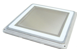
Trampoline Mounted Screen