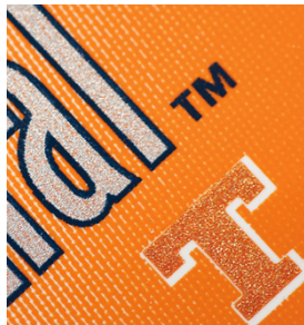
Sharp edged and well readable text on labels printed with SEFAR PCF FC