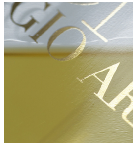
High dense sharp edged letters on perfume flacon with SEFAR PCF FC