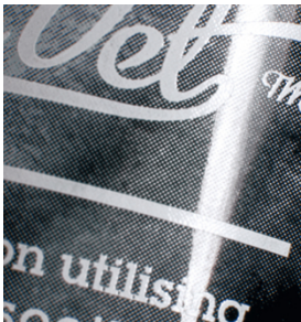
Outstanding printing quality of fine halftones on plastic tubes printed with SEFAR PCF FC

Expand your options with SEFAR PCF for screen printing on plastic containers, labels, glass ware, optical discs and many other challenging print substrates.