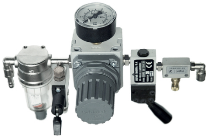
The simple control unit in combination with SEFAR 3A