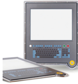
Clear and durable signs and inscriptions printed with SEFAR PME (© Danielson Europe BV)