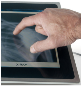
Whether edge masking or protective coatings using SEFAR PME