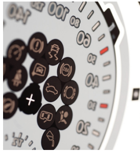
In the fast lane with the highest efficiency and quality printed with SEFAR PME