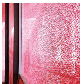
For a precise and durable print image on the glass facade with SEFAR GLASSLINE 68/175-95W