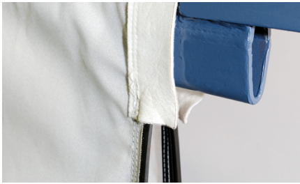
Optimal sealing design